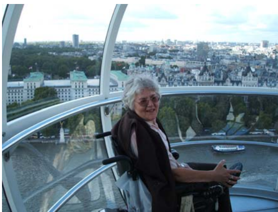
"It gets even better"

Before heading towards Westminster Bridge the coach driver took us around Buckingham Palace and down the Mall passing at just the