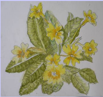
Primroses – painted in the spring of this year, Pencil and watercolour.