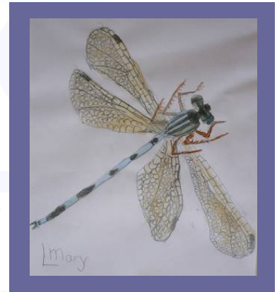
Dragonfly – painted last year, picture taken from a book. Sketched in pencil and completed in watercolour.

Debbie says the speed in which Mary produces a painting is amazing, from sketch to finished painting will often only take two hours.