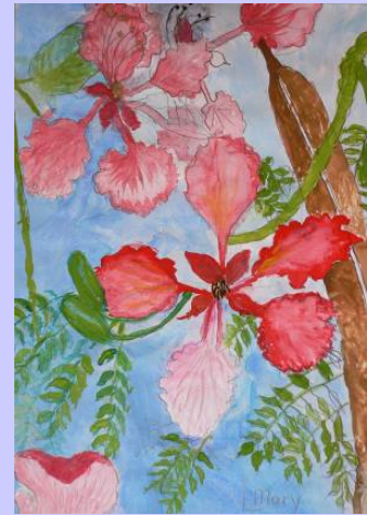
Red flowers – picture taken from a book, Pencil and Watercolour.